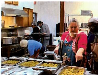
Washington First Assembly of God